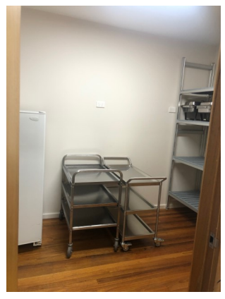
Thank you to all concerned with bringing this project to fruition.